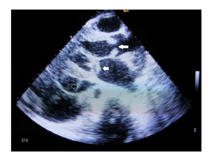
Fig 1: 2D Echo-parasternal long axix view showing vegetation in aortic and mitral valve position (as shown by white arrowheads) & pockets of pericardial effiusion along posterior wall(as shown by black arrowhead)

vegetation of 12x8mm in mitral[Fig.1] and two such attached to aortic valves the larger of which measuring 11x10mm[Fig.2] .There was a large pericardial effusion measuring fluid width of 22mm posteriorly[Fig1],14mm antero-lateral and 12mm along inferior surface[Fig.2].