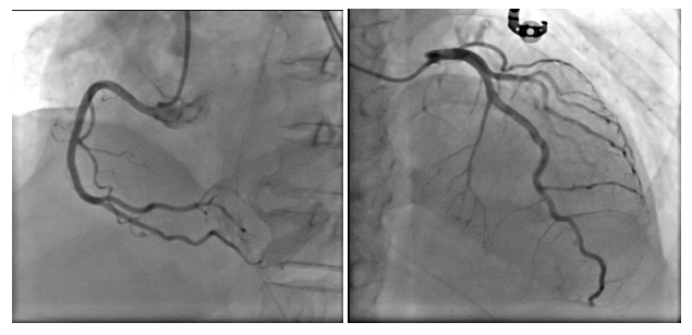
Figure 2: Normal Right Coronary Artery, Minor disease in Left Coronary Artery on angiogram