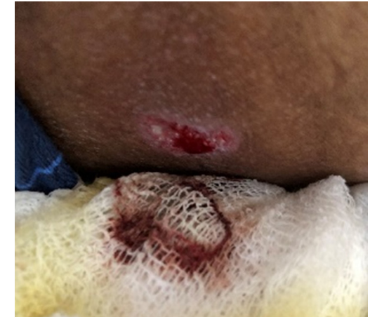
Figure 1: Drained skin abscess on lower back of patient

with antipyretics. Patient had retrosternal chest pain, stabbing type, mild in intensity, aggravated on inspiration along with occasional cough and relieved on sitting up. On examination, his vitals and systemic examinations revealed no apparent abnormality. On further evaluation, he had a wound of size 2.5x2.5 cm on his lower back which was initially a painful swelling, drained and closed in local medical facility but culture sensitivity test of the drained pus was not done.