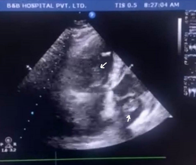
Figure 1: Bi-atrial thrombus traversing through AV valves