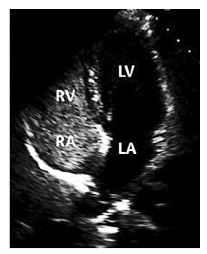
Figure 2: Normal saline contrast echo showing bubbles confined to right sided chambers.

In addition, certain physiological maneuvers may be used to provoke right to left shunting like Valsalva maneuver, deep inspiration, cough, or abdominal compression. Generally, the right atrial pressure is always lower than the left atrial pressure so at rest small PFO or intracardiac shunt maybe missed when performing the test at resting condition. These maneuvers may help to increase the sensitivity of detection of PFO compared to doing the test at rest alone.