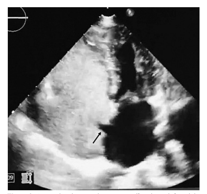
Figure 3: Arrow showing negative contrast effect due to left to right shunt (ASD)